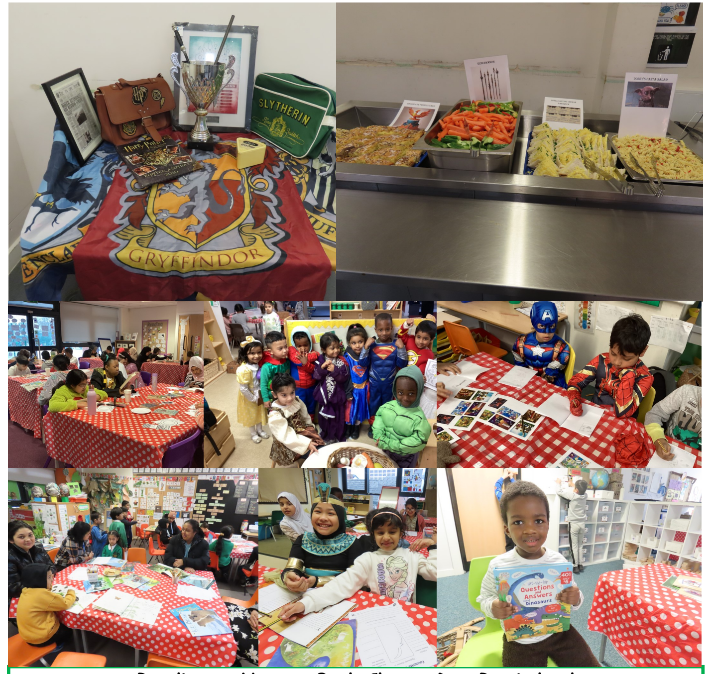
Reading at Home - Book Change Day Reminders!

Please ensure your child brings their reading book and library book back to school on the days below so they can be issued with new ones!